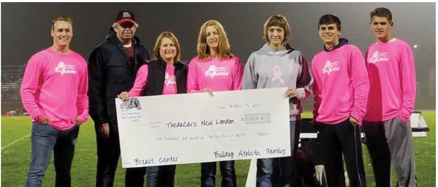
Bulldog Soccer Captains present a donation of nearly $2000 to representatives of Theda-Care New London Breast Cancer Center.